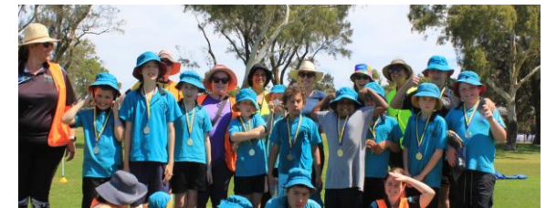
Our Soccer Team with their medals at the ESSN Soccer Carnival

Coolbellup Learning Centre values lifelong learning, collaboration, participation, equity, and excellence. This is fostered through strong partnership between students, staff, parents/carers, and our colleagues within the Coolbellup community.